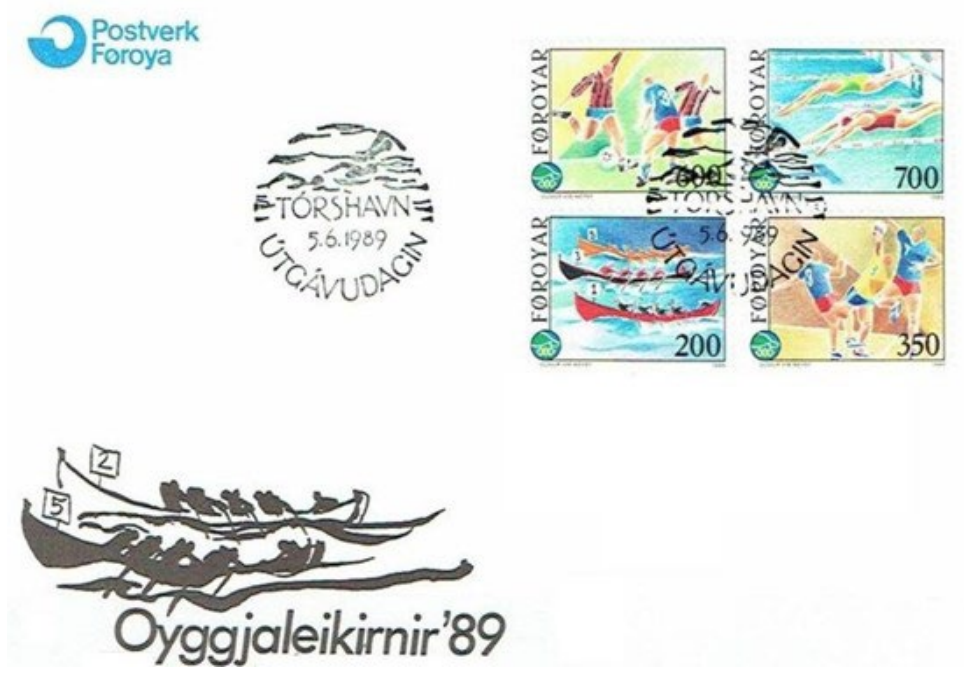
Figure 2: 1989 Island Games. First Day Cover. Issue date: June 5, 1989

far only five of them have been confirmed to have issued Island Games stamps. All these 5 territories only issue stamps when they host the games.