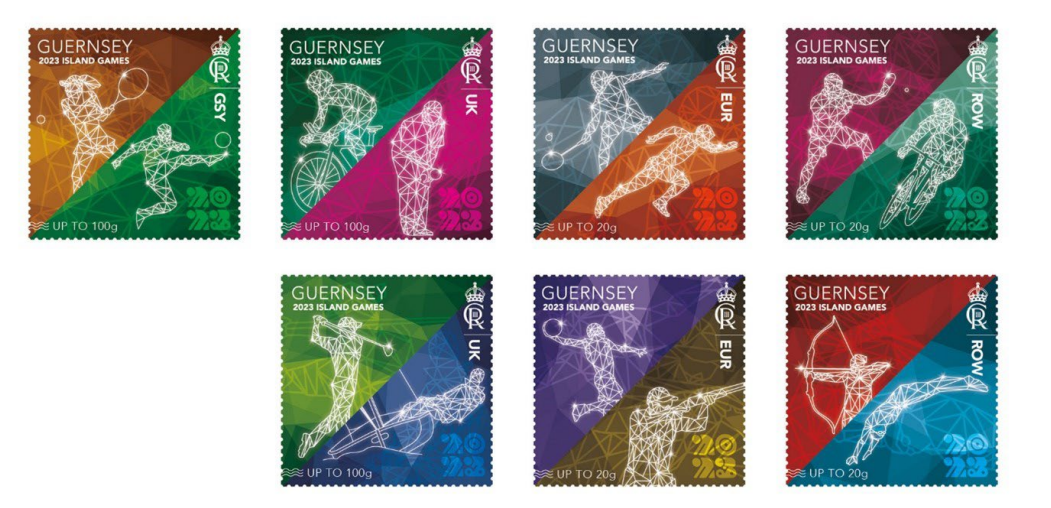
Figure 10: 2023 Island Games Stamp. Issue date: May 24, 2023

has issued a set of seven stamps (Figure 10) and a miniature sheet (Figure 11) on May 24, 2023<sup>8</sup>. It's worth noting that there are still 14 official competitions in this edition of the Island Games. Each stamp features two sports, and the additional miniature sheet features the mascot<sup>9</sup>.