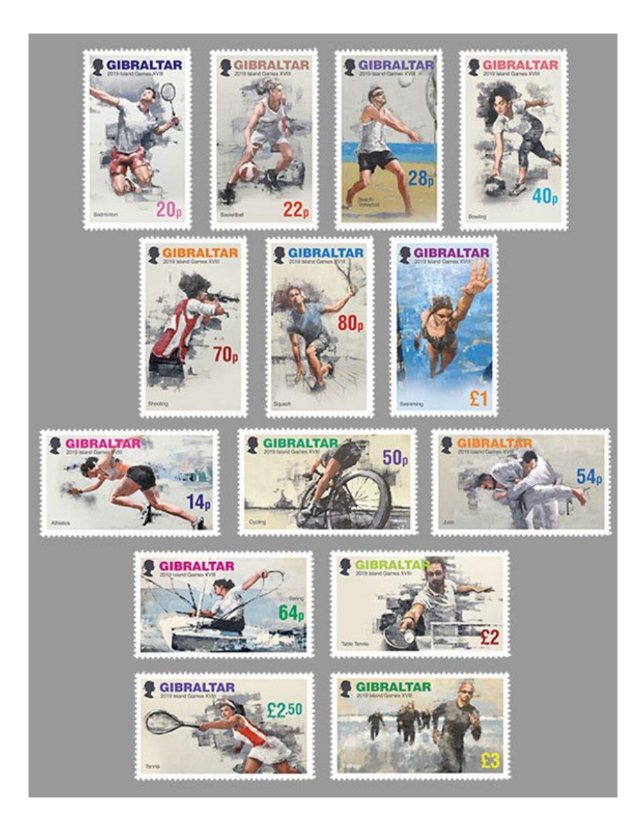
Figure 9: 2015 Island Games. First Day Cover. Issue date: April 25, 2019

In 2019, Gibraltar did something similar and issued 14 stamps (Figure 9) featuring athletics, badminton, basketball, beach volleyball, bowling, cycling, judo, sailing, shooting, squash, swimming, table tennis, tennis, and triathlon.<sup>6</sup>