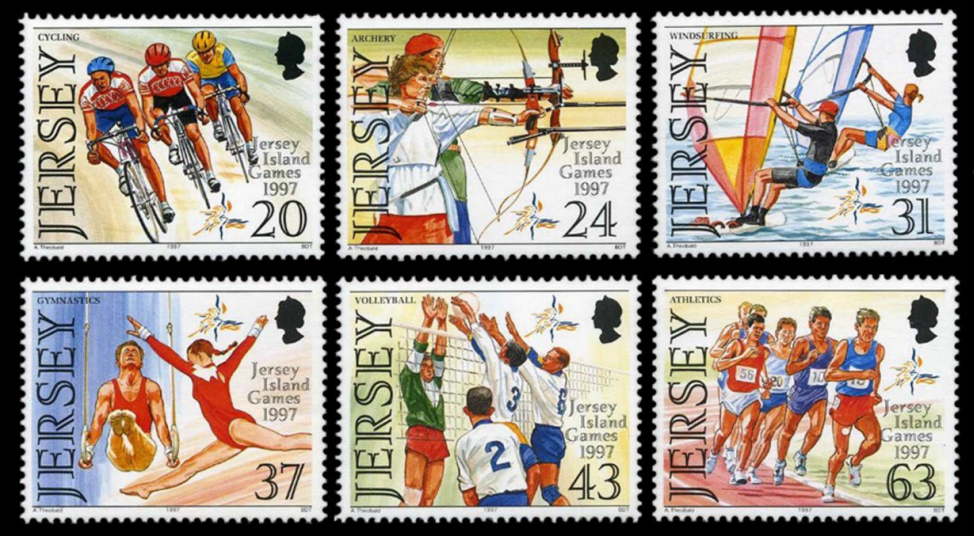
Figure 5: 1997 Island Games stamps. Issue date: June 28, 1997

In 2003, Guernsey hosted the Island Games for the second time but first issued stamps for the games at the beginning of the year. Six stamps (Figure 6) featuring six sports out of 15 competitions. They are Athletics, Mountain biking, Gymnastics, Windsurfing, Golf and Triathlon.