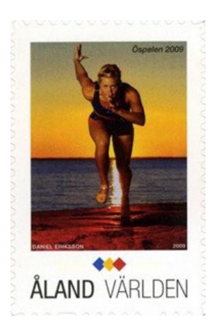
Figure 7: 2009 Island Games stamp. Issue date: June 27, 2009

In 2015, Jersey hosted the 16<sup>th</sup> edition of the Island Games and issued 14 stamps (Figure 8) for all 14 official competitions. They are archery, athletics, badminton, basketball, cycling, football, cycling, football, golf, sailing, shooting, swimming, table tennis, tennis, triathlon and volleyball.