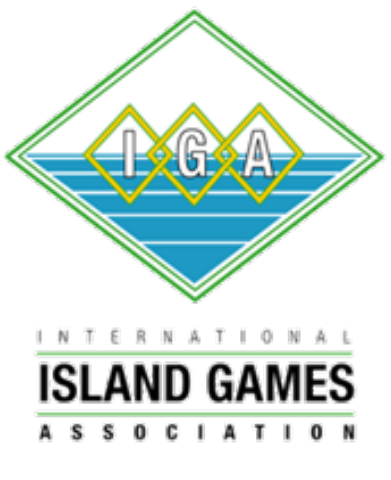
Figure 1: The logo of IIGA^1

Stamp collectors who have an interest in sports may likely focus on collecting stamps related to major events such as the Olympics, Commonwealth Games, Asian Games, and Pan American Games. However, there are also numerous other multi-sport games that are worth paying attention to, including the Island Games.