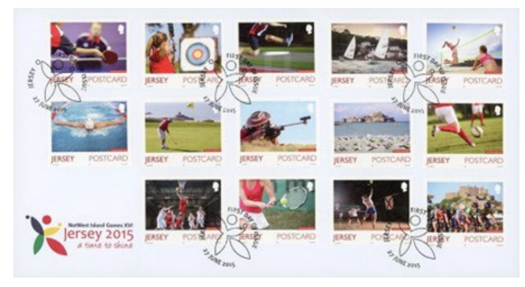
Figure 8: 2015 Island Games. First Day Cover. Issue date: June 27, 2015

In 2015, Jersey hosted the 16<sup>th</sup> edition of the Island Games and issued 14 stamps (Figure 8) for all 14 official competitions. They are archery, athletics, badminton, basketball, cycling, football, cycling, football, golf, sailing, shooting, swimming, table tennis, tennis, triathlon and volleyball.