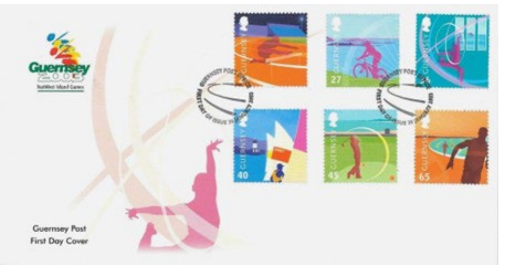
Figure 6: 2003 Island Games. First Day Cover. Issue date: January 30, 2003

In 2003, Guernsey hosted the Island Games for the second time but first issued stamps for the games at the beginning of the year. Six stamps (Figure 6) featuring six sports out of 15 competitions. They are Athletics, Mountain biking, Gymnastics, Windsurfing, Golf and Triathlon.