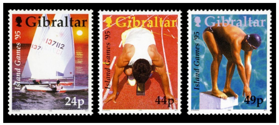
Figure 4: 1995 Island Games stamps. Issue date: May 8, 1995

In 1995, Gibraltar hosted its first Island Games as the only member located on a peninsula, and they issued three stamps (Figure 4) featuring sailing, athletics, and swimming.<sup>5</sup>